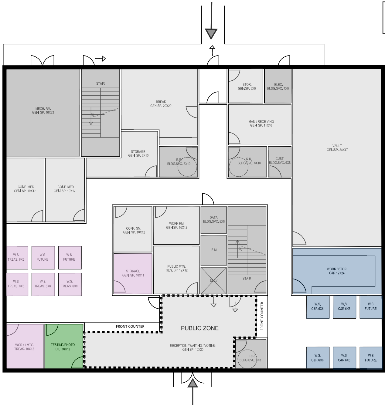
FIRST FLOOR PLAN PUBLIC PARKING